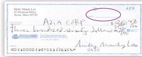
Image Usability - Is the information on the check present and readable?