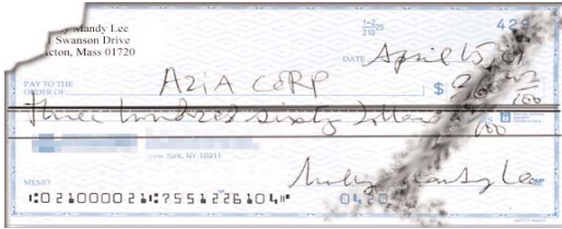
Image Quality – Are there bent corners, streaks, bands or is the image too dark, etc?