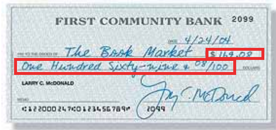
QuickStrokes recognizes the courtesy amount (CAR) and legal amount (LAR) from personal and business checks.

QuickStrokes also handles Image Replacement Documents (IRDs), the new check-like documents authorized under the federal Check 21 Act.